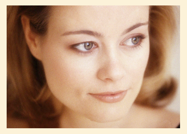
The NaturaLase 1064 sets a new standard of care for the removal of tattoos and pigmented lesions.